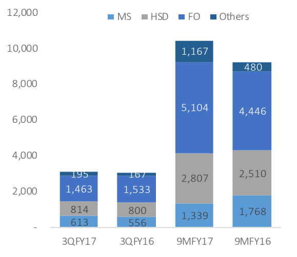
Exhibit: PSO - MS, HSD, FO market share